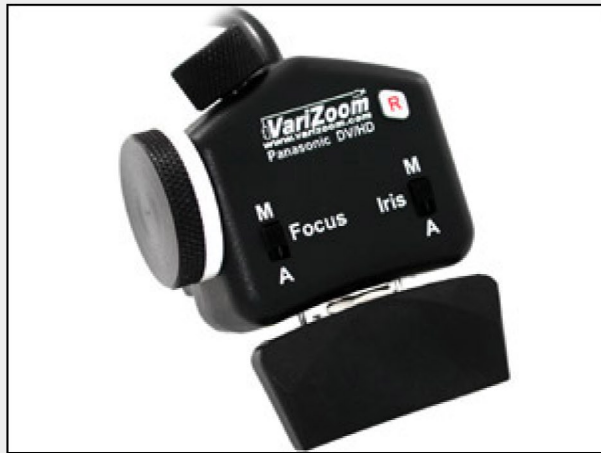
PZFI Zoom/Focus/Iris Control for Panasonic HVX200, DVX100B, and HPX170.

Panasonic HVX200, HPX170, DVX100B Controllers